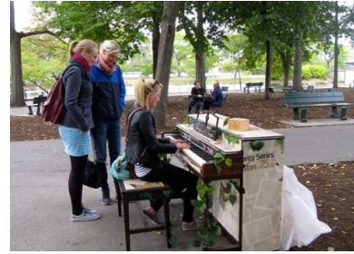
Play Me I'm Yours