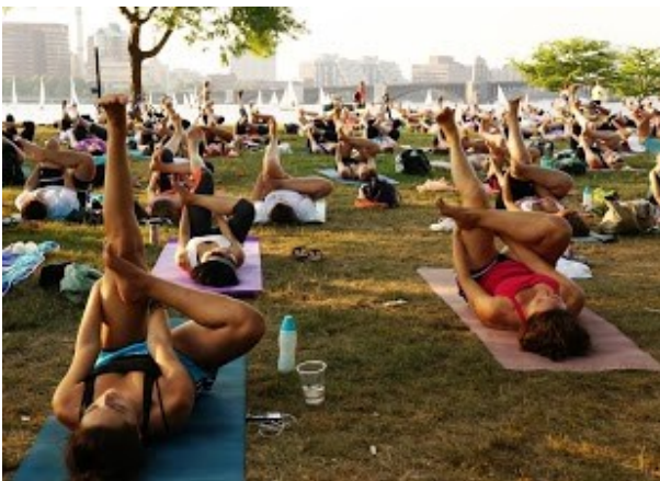
Healthy, Fit & Fun