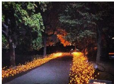
Lucy Light Forest