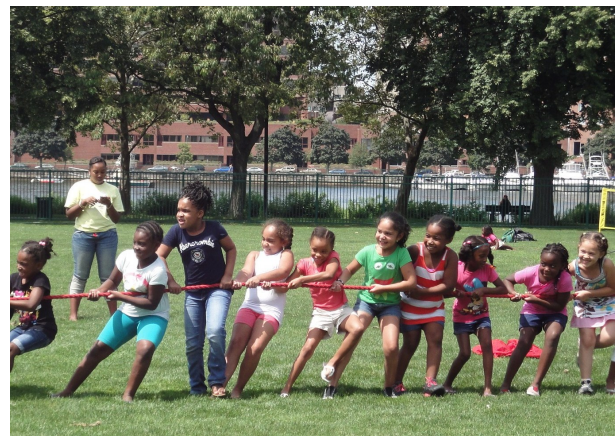
Children in the Park