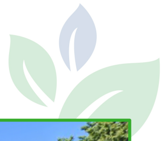
Dartmouth St Footbridge